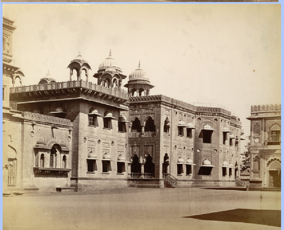
Photgraphs of Old Building of Rajaram College (Palace – Bhavani Mandap, Kolhapur)